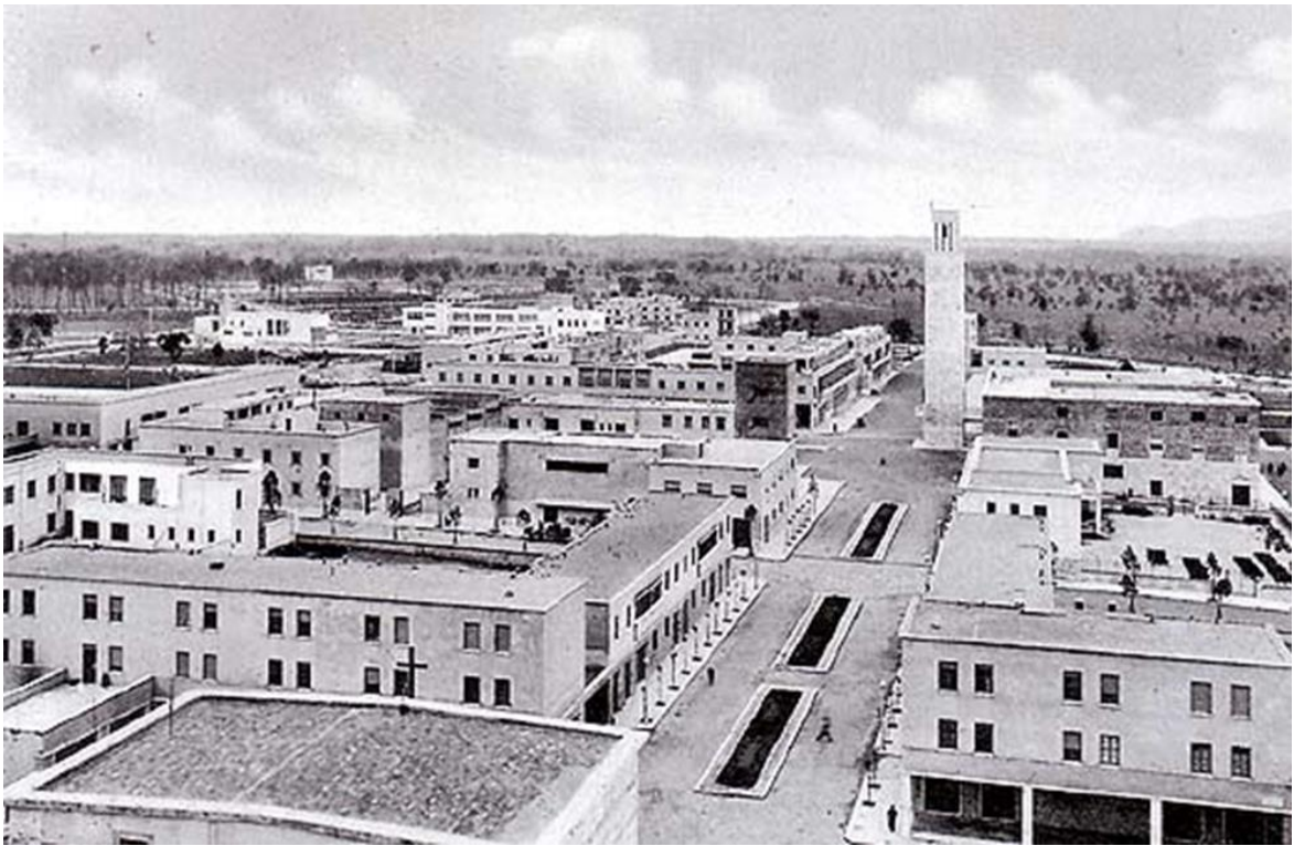
Fig. 4. Historical photo of Sabaudia city