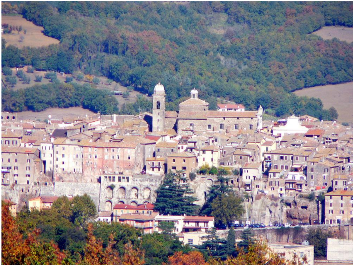
Fig. 2. View of Orte city