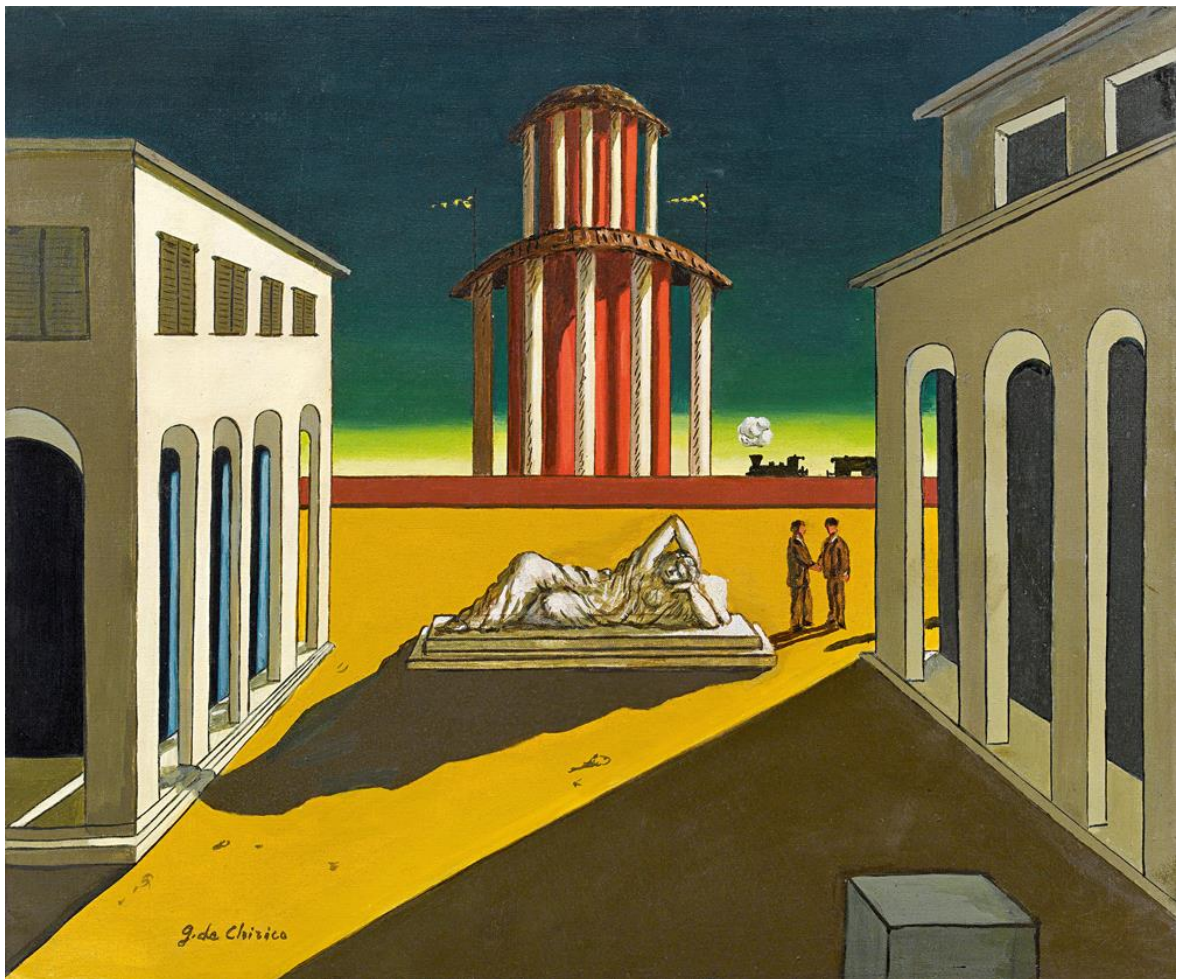
Fig. 5. Giorgio de Chirico (1888 - 1978), Piazza d'Italia, oil canvas, 1964