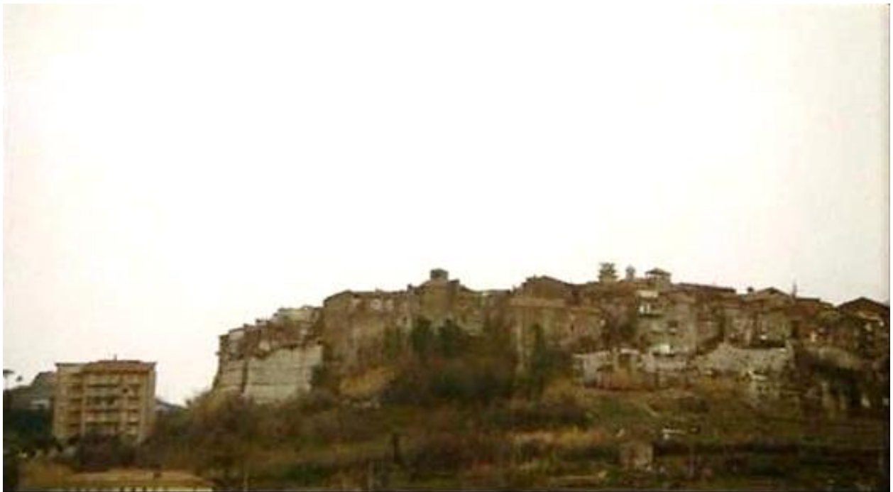
Fig. 3. Photo from the RAI TV video [5] of Orte. At bottom left the new building that for Pasolini is a break of the historical continuity