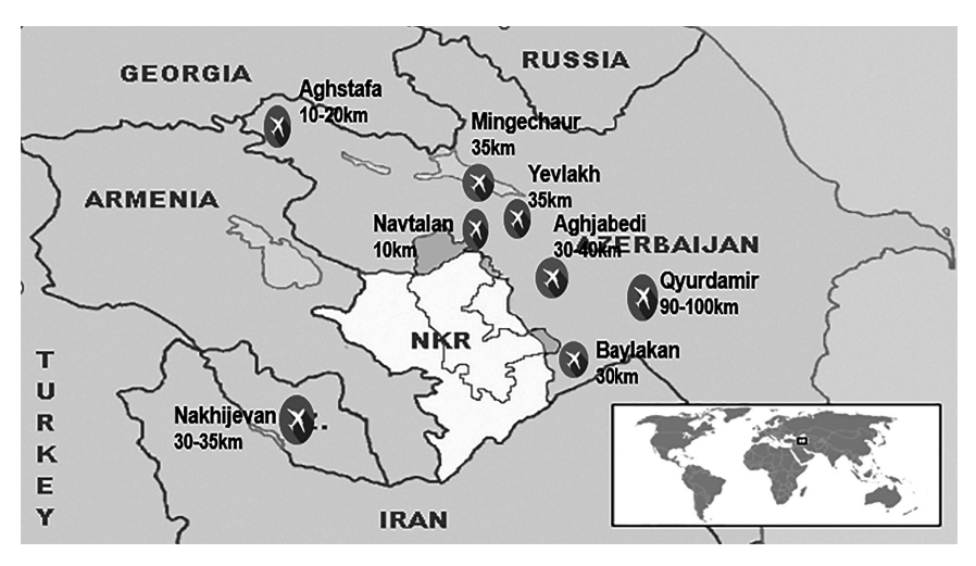
Figure 3 Air-bases of Azerbaijan locate near Armenian or Karabakhi borders

airbases of Navtalan (10km), Agstafa (10-20km), Aghjabedi (30-40km), Baylakan (30km), Mingechaur (45km), Yevlakh (35km) and Qyurdamir (90-110km). Interestingly enough, airbases of Aghjabedi, Mingechaur and Baylakan are constructed in time interval 2014-2017, the base in Yevlakh was also reconstructed during this period.<sup>44</sup> It is clear, Azerbaijan strongly contributes to the development and equipment of airbases, especially those located close to the Armenian or Karabakhi borders. The figure below illustrates the statement made above (newly constructed air-bases are marked in green).